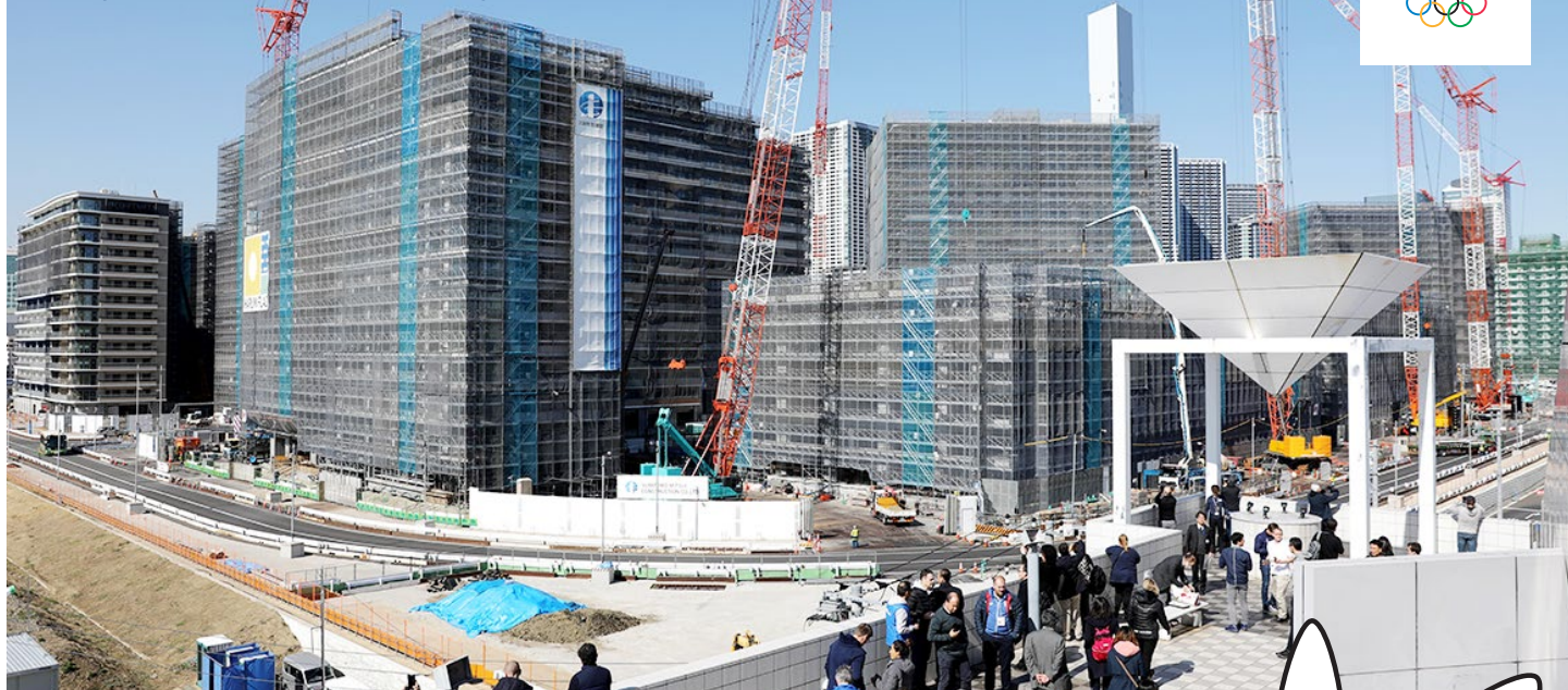
5th NOC Open Days Venue Tour, Olympic Village, 18 March 2019, Tokyo.