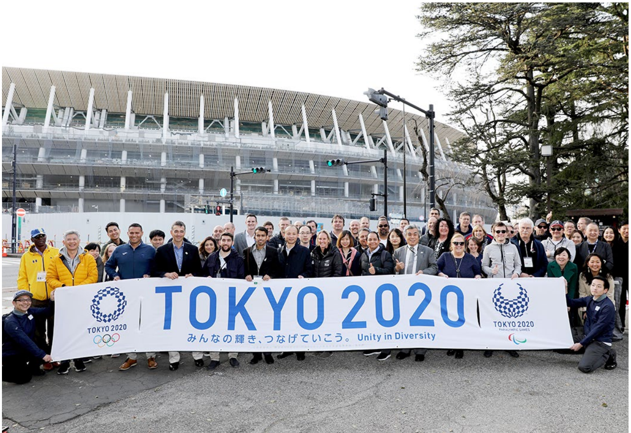
5th NOC Open Days Venue Tour, Olympic Stadium, 18 March 2019, Tokyo

Please refer to the Rate Card Ordering Portal User Manual for the registration/login process and to Tokyo 2020 Connect for more information about Spectrum application and timelines.