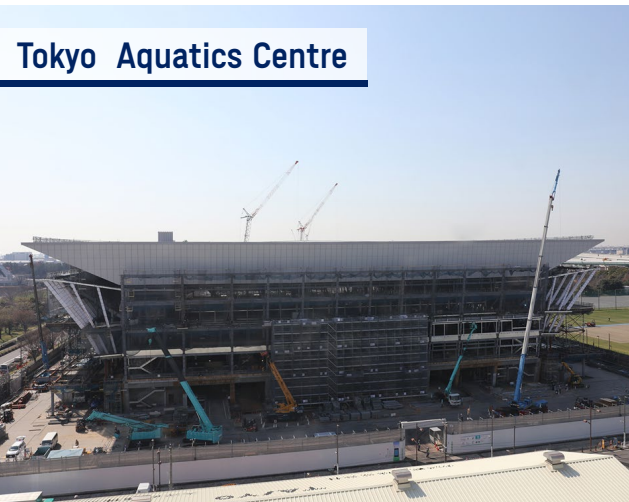
as of 15 March 2019