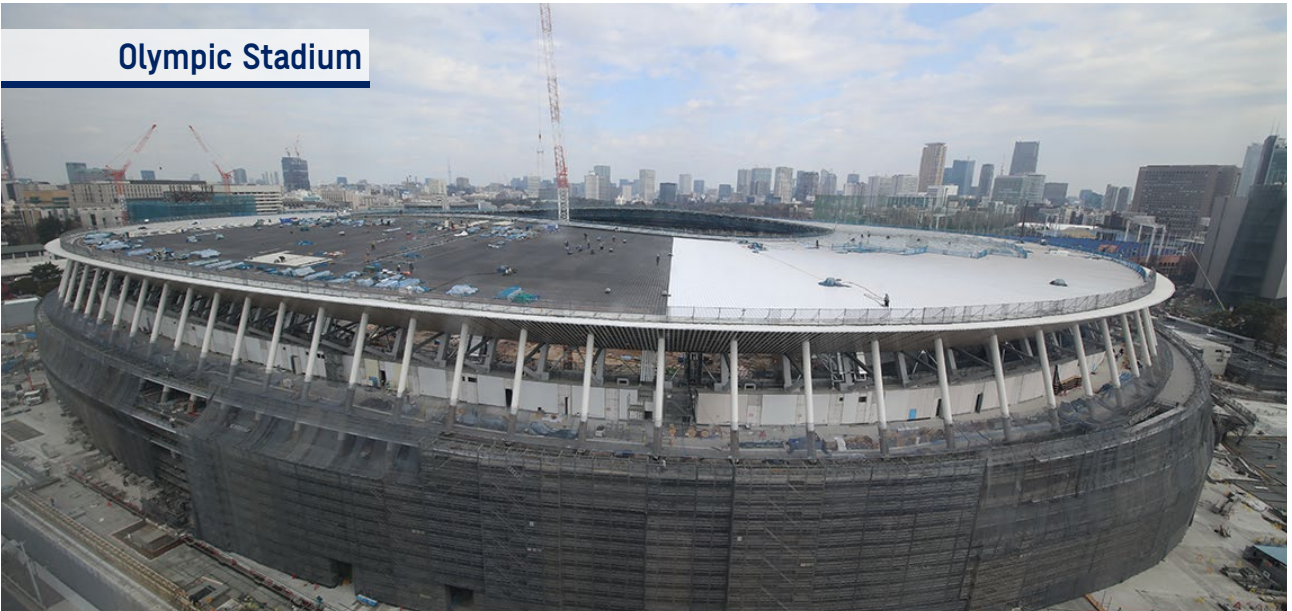
As of 1st March 2019